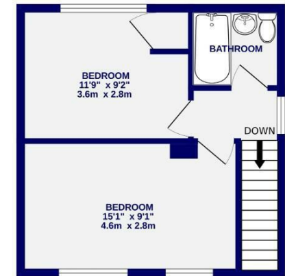
1ST FLOOR 328 sq.ft. (30.5 sq.m.) approx.